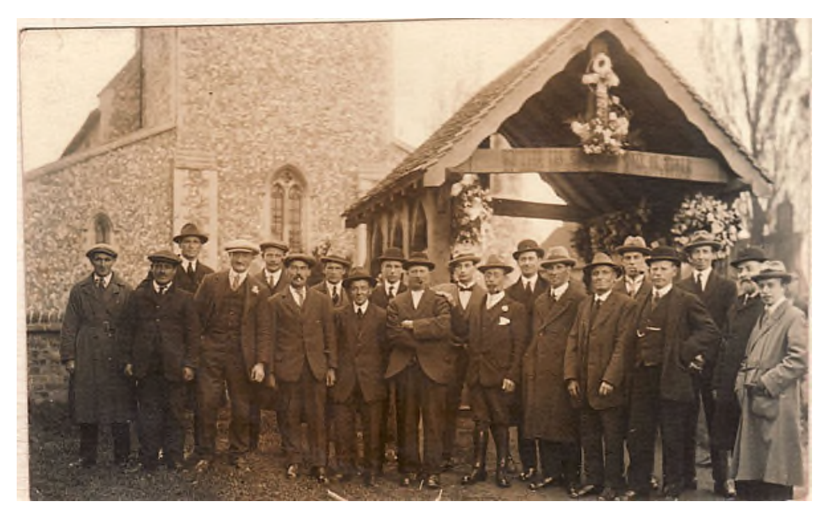
Sunday 24 April 1921 Dedication of Sandridge Lychgate War Memorial

TO THE GLORY OF GOD THIS LYCHGATE WAS ERECTED IN GRATEFUL MEMORY OF THE MEN OF THIS PARISH WHO GAVE THEIR LIVES IN THE GREAT WAR 1914 - 1918